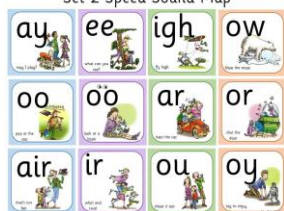
Set 2 Speed Sound Map