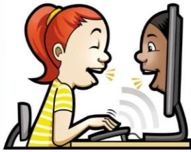
A Parent's Guide to Social Media