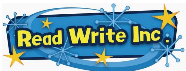
Speed Sounds Set 2