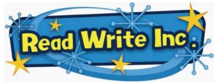
Speed Sounds Set 2