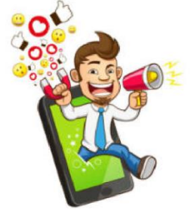
A Parent's Guide to Live Streaming