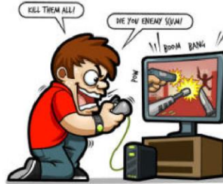
A Parent's Guide to Gaming