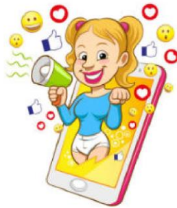
A Parent's Guide to Online Influencers