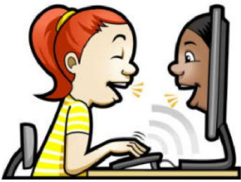
A Parent's Guide to Social Media