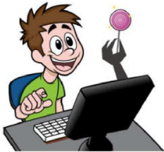
A Parent's Guide to Online Grooming