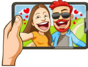
A Parent's Guide to Sharing Pictures