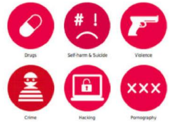
A Parent's Guide to Privacy Settings

Online safety is when young people know who they can tell if they feel upset by something that has happened online.