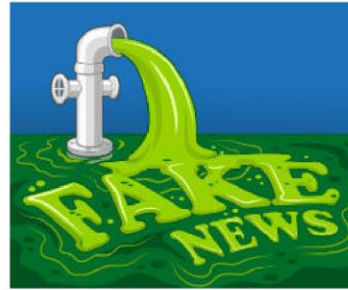
A Parent's Guide to Fake News