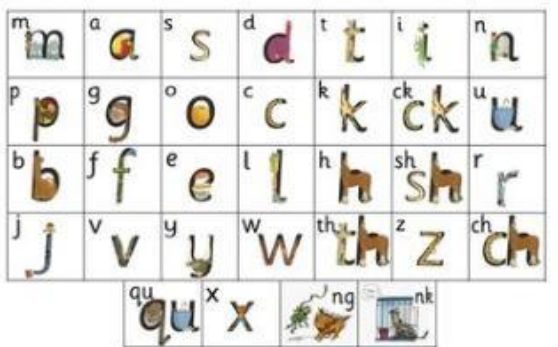
Set 2 Sounds